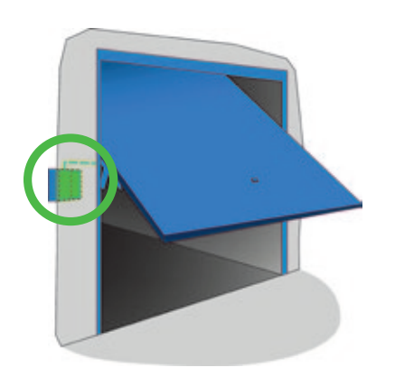
Fig. 4: Swing-up garage door