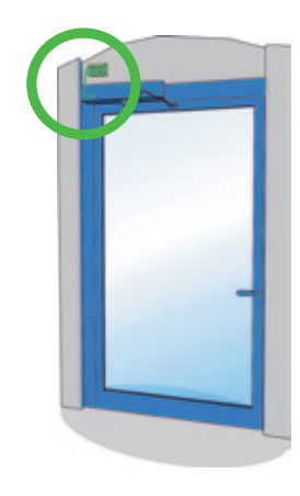
Fig. 2: Swing door